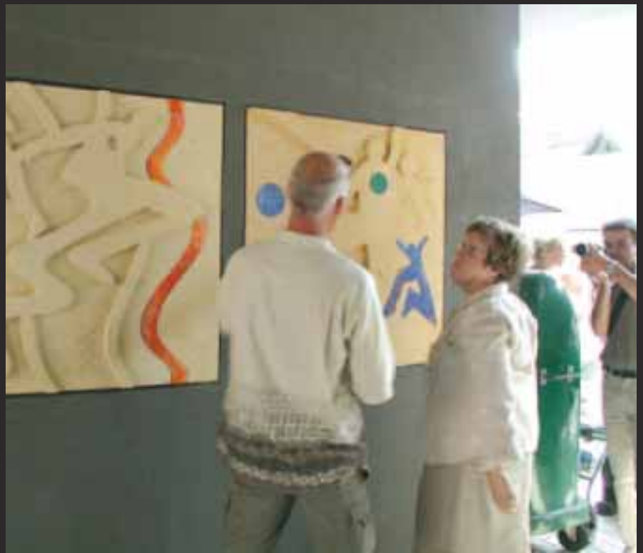
The challenge was to emphasize the atmosphere you find when you pass through a gate from street to yard.

The long creation process started with a preparation of the motifs in the computer's image processing program. The many small elements were then machined in a special polystyrene material. The artist then glued the elements together to form the final mould, in which additional figures were scored out. The 12 reliefs were then cast at Gandrup Elementfabrik (Gandrup Precast Factory) in Denmark in a spectrum of mainly light yellow, red, green and blue shades. After casting, brightly coloured stamped out plastic and metal fragments were inserted into the preformed recesses, giving a bright contrast to the pastel colours.