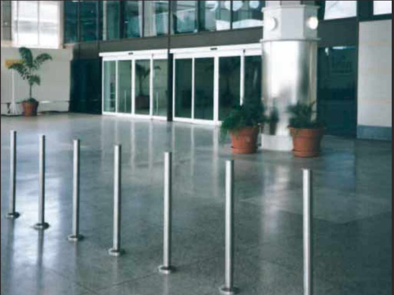
The terrazzo floors at the Grantley Adams International Airport Expansion Project, Barbados, West Indies.

AALBORG WHITE® has once again gained visibility and usage in the Caribbean. AALBORG WHITE® has over the last 2 years been used in the manufacture of terrazzo floors at the Grantley Adams International Airport Expansion Project, Barbados, West Indies.