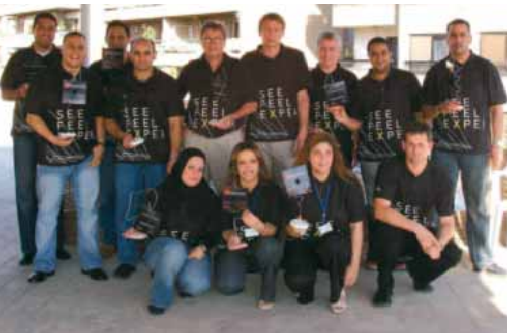
The 10 participants all came from the Sinai White Cement Company, from sales and market related positions.

The first Dragon Gate Basic Diploma course held outside Aalborg was run on 28th and 29th of June at Sinai White Cement's office in Cairo. The 10 participants all came from the Sinai White Cement Company, from sales and market related positions.