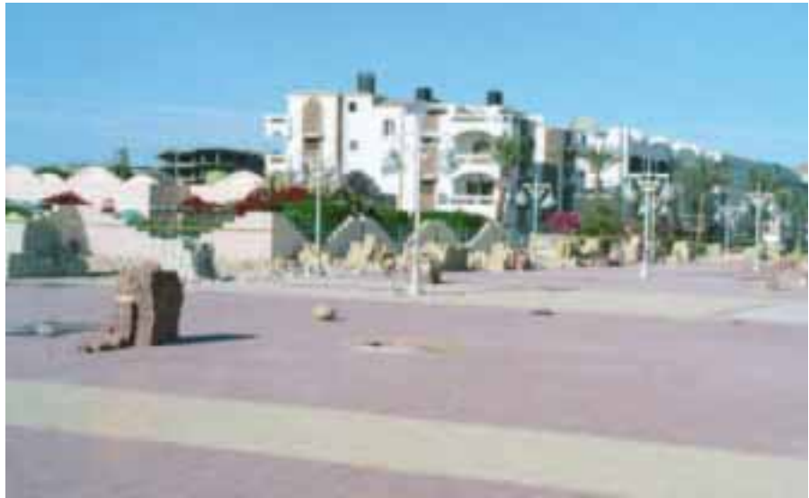
The flooring of the project in Hurghada is exclusively constructed from SWC's white cement.

Hurghada is one of the most attractive tourist cities in Egypt, with its sandy beaches, sun, sea, good weather and unspoilt beauty. The city has recently experienced a very active period of construction and development, to meet