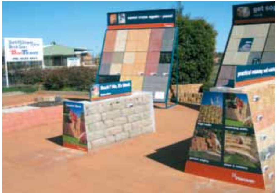
Darling Downs Bricks Sales – the 860 square meters of displays is providing the biggest display west of Brisbane.

A further reason for moving was the need for more space to display bricks,