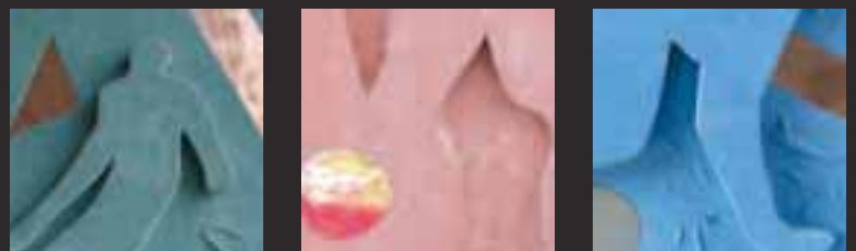
After the casting, brilliantly coloured punched plastic and metal fragments have been fitted in the holes which gives a happy contrast to the pastel shades.