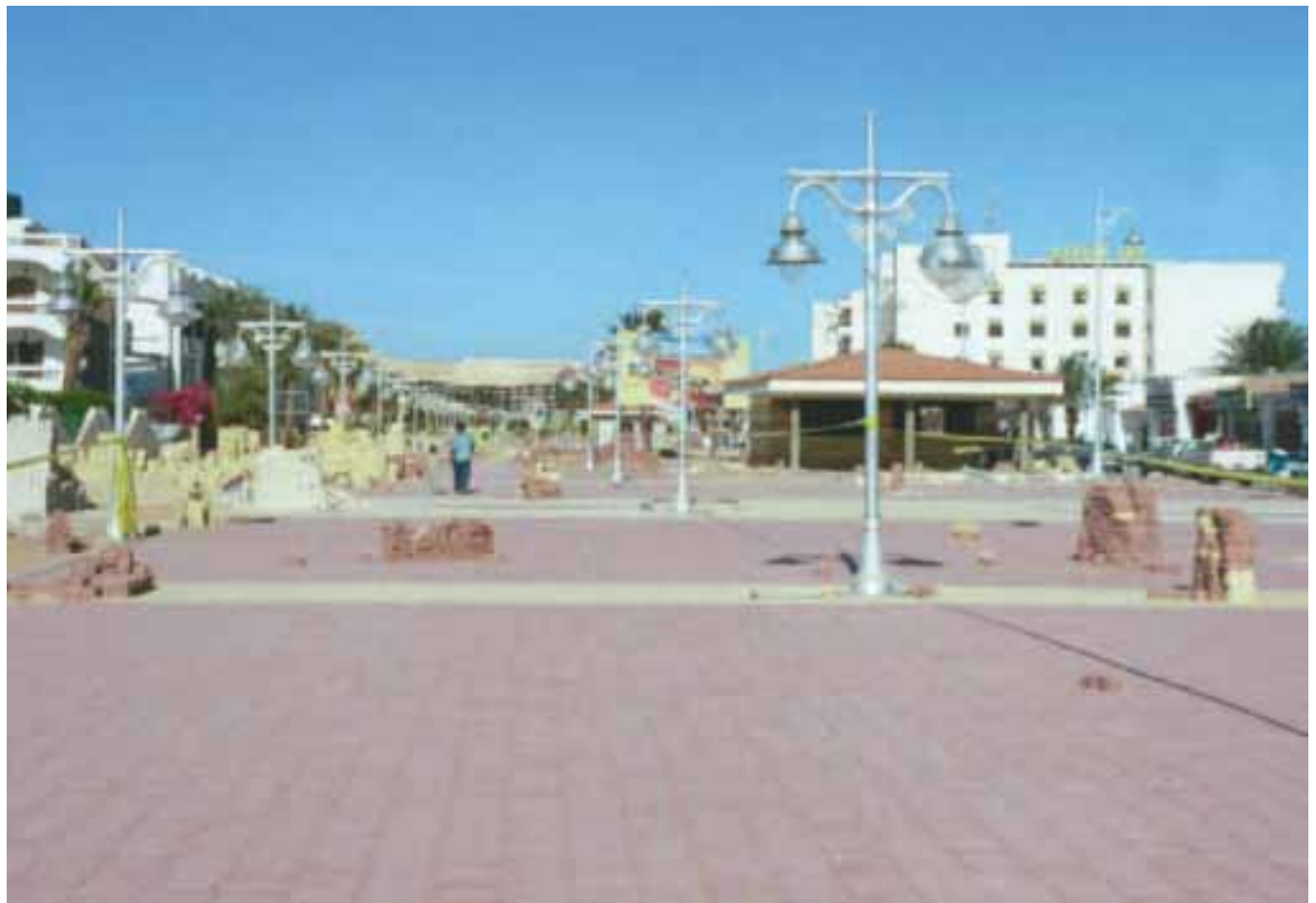
The panoramic side-walk, where an open air exhibition for cultures, arts, and music will take place to show the value of combining different types of civilizations at the same place.

SWC is very proud to be a partner in a project that adds to the value of the city of Hurghada and supports the city's position on the tourist map of the region.