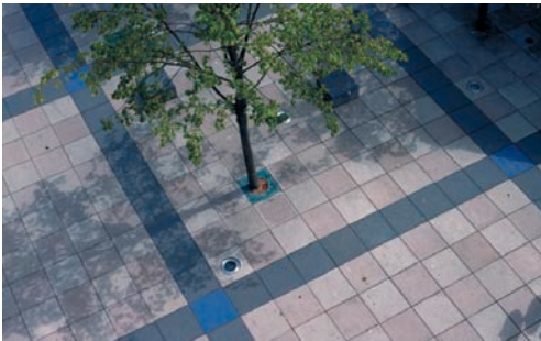
By alternating between dark (grey cement) and light (white cement) surfaces, paving can be used decoratively...

In smaller spaces, such as courtyards and halls, light surfaces may be used to create a feeling of space and air.