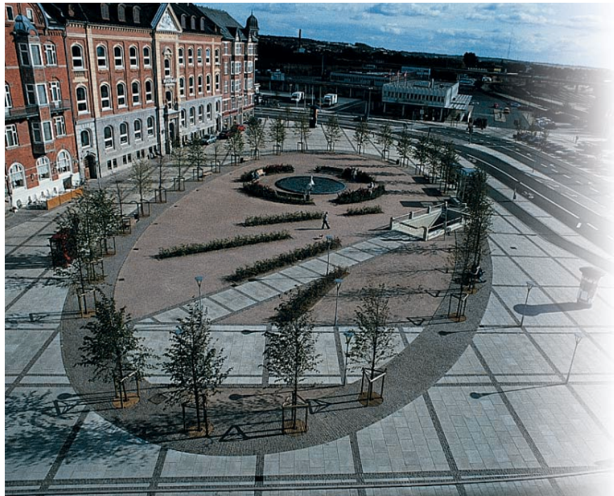
...or to enhance pathways and other distinct patterns in the layout of the square.