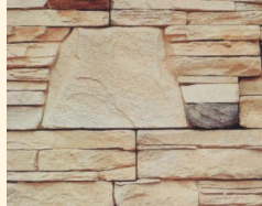
Stacked Stone with Jumpers