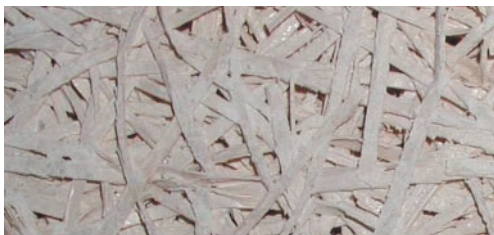
Texture and colour of wood fibre concrete produced with AALBORG WHITE® .

Wood fibre concrete slabs are popular in certain geographical areas, primarily for sound insulation purposes and precisely because they effectively absorb sound. Therefore, in sports halls and other large enclosed areas such as Aalborg Airport the slabs are the obvious choice in ensuring a comfortable acoustic climate. Previously, wood fibre concrete slabs were made mainly with grey cement as the base material that was then often painted. Today, and to an increasing extent, they are based on white cement and the slabs thus assume a lovely light wood colour.