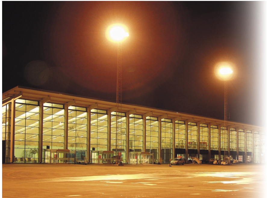
The new light open glass front towards the airside welcomes the arriving passengers to Aalborg Airport.

Picture to the left: A view of the ceiling sheets before entering into the arrival lounge.