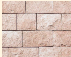
Berkshire Castle Stone

It is now possible to produce any type of stone finish, for any structure, internal or external, using AALBORG WHITE® cement. What is more, with AALBORG WHITE® cement there is no limitation on colour.