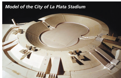
Model of the City of La Plata Stadium