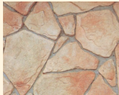
Mountain Stone Monarch