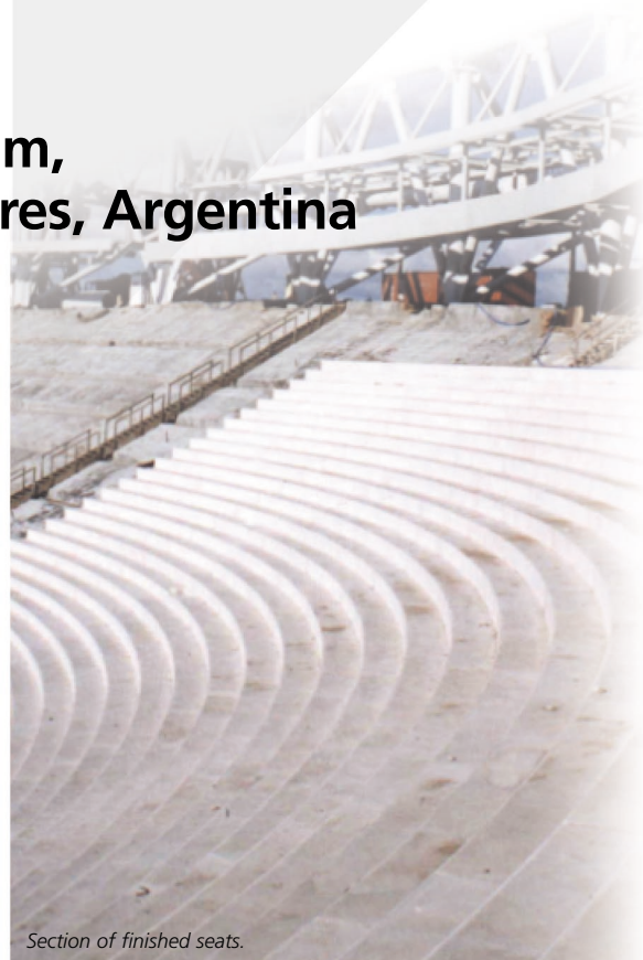
Section of finished seats.