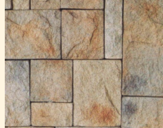
English Castle Stone