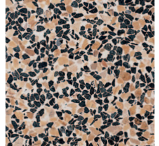
Top left: Floor in museum, Copenhagen, Denmark Middle left: Arlanda Airport, Sweden. Photographer: Daniel Hertzell Top right: Train station, Sweden. Photographer: Daniel Hertzell